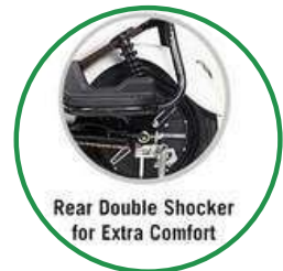
Rear Double Shocker for Extra Comfort