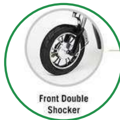
Front Double Shocker