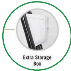
Extra Storage Box