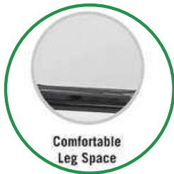
Comfortable Leg Space