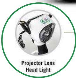
Projector Lens Head Light