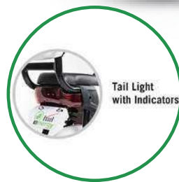
Tail Light with Indicators